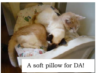
A soft pillow for DA!