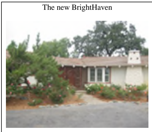
The new BrightHaven