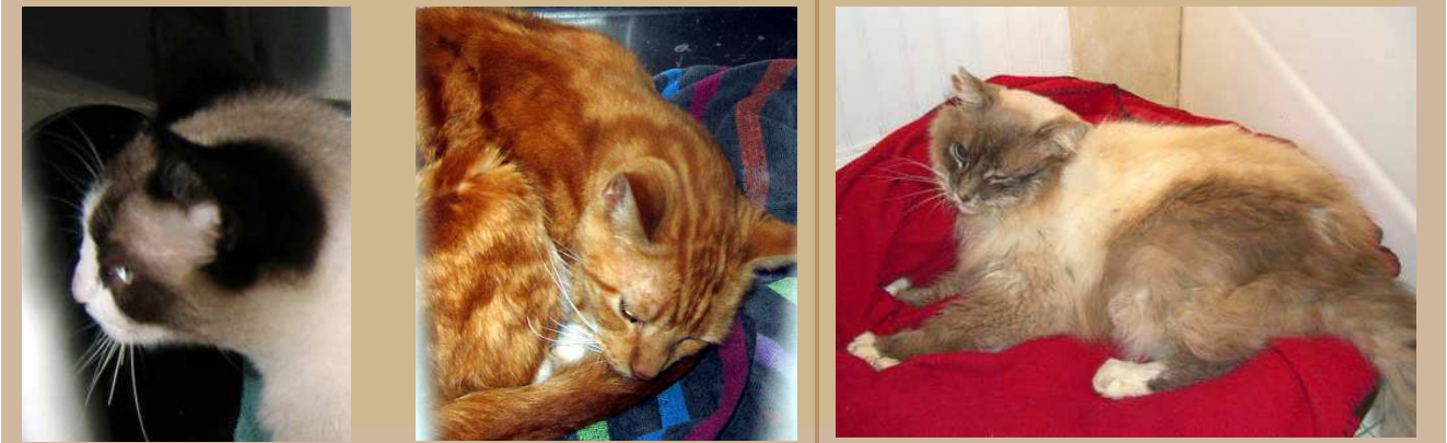
Simon - a one-year-old blind, cream and chocolate point, male Siamese mix. AND WE DID!!

This last week, we all worked diligently to find homes for: