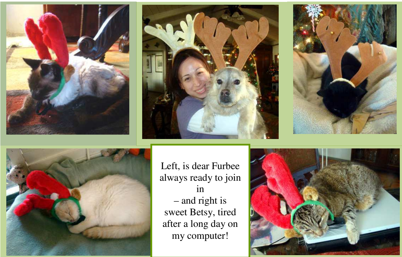
Left, is dear Furbee always ready to join in – and right is sweet Betsy, tired after a long day on my computer!