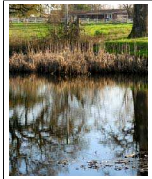
A view of BrightHaven from the pond