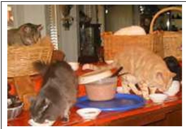
Feeding time in the BrightHaven kitchen