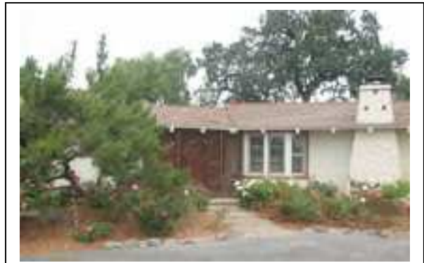
BrightHaven is situated on 10 acres in beautiful Santa Rosa in Northern California.

We are BrightHaven. .... a family - a sanctuary - a way of life.